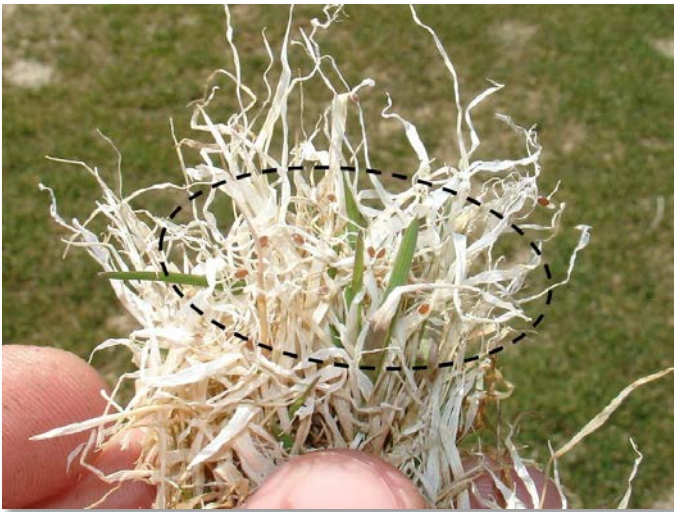
Fig. 3. Reddish brown sclerotia (~ 5 mm) produced by Typhula incarnata imbedded in leaf tissue of creeping bentgrass.

If Microdochium patch is present on high priority surfaces (e.g., greens and tees), a curative fungicide application maybe warranted to arrest further disease development. Several options are available (Table 1); however applications should contain a tank mix of, or premix product containing a contact (or local penetrant) and a systemic fungicide. Initial applications should be made as soon as symptoms are observed, and before any mowing or dragging is conducted to prevent spread of the disease. A follow up application should be applied 14-d later.