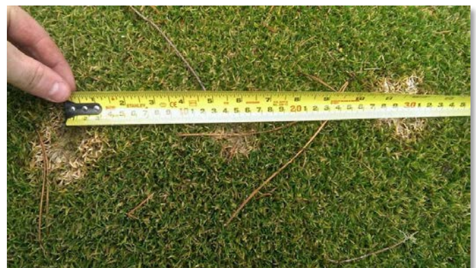
Fig. 2. Spread of Microdochium patch on roller of mower.